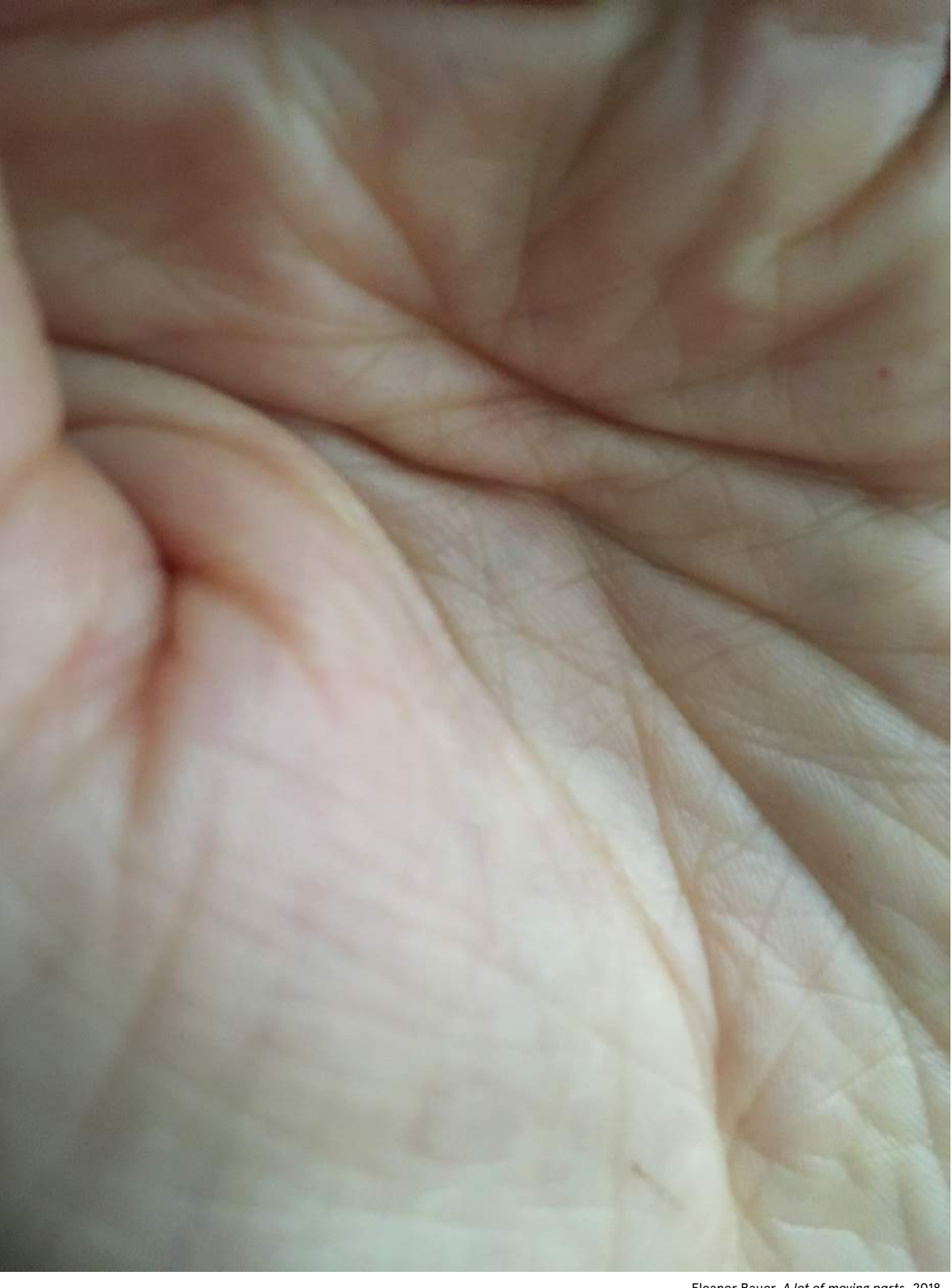
Eleanor Bauer, A lot of moving parts, 2018