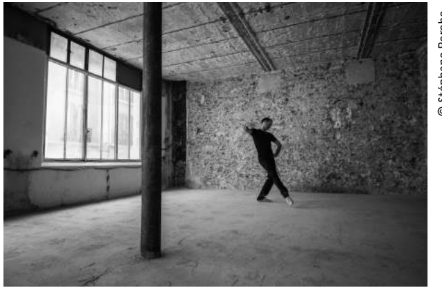
Benjamin Millepied, Mutant Stage 3 . Film produced by Lafayette Anticipations in 2015, prior to the opening of 9 rue du Plâtre.