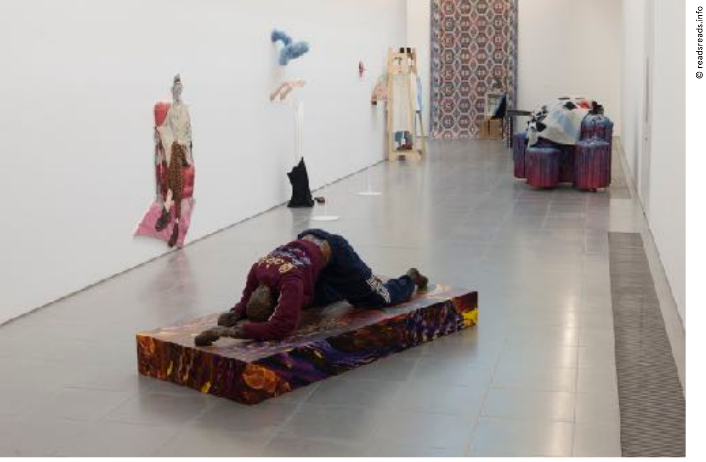
Atelier E.B, Passer-by Exhibition view, Serpentine Sackler Gallery, London (3 Oct 2018 to 6 Jan 2019)