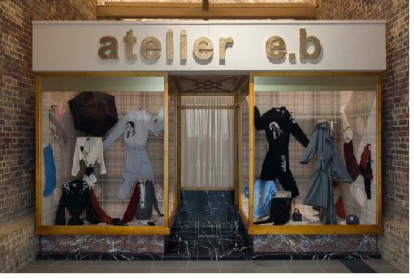
Atelier E.B, Passer-by Exhibition view, Serpentine Sackler Gallery, London (3 Oct 2018 to 6 Jan 2019)