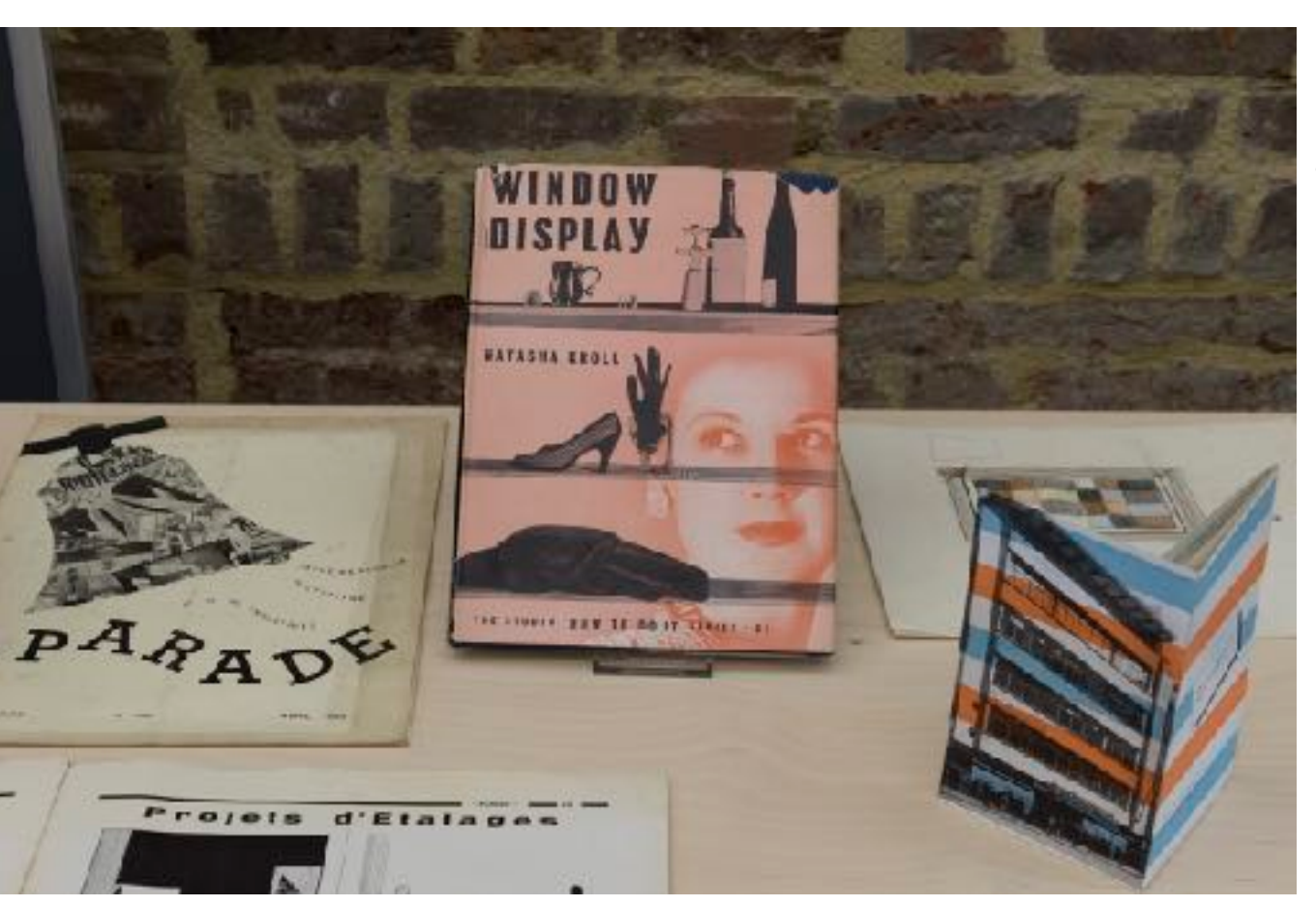
Atelier E.B, Passer-by Exhibition view, Serpentine Sackler Gallery, London (3 Oct 2018 to 6 Jan 2019)