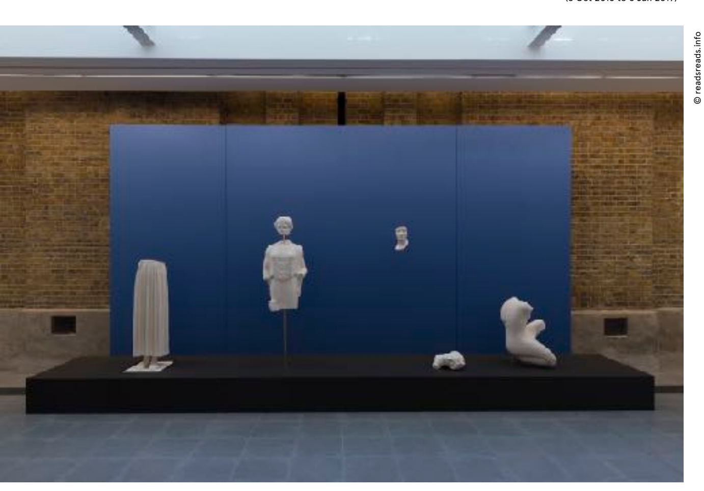
Atelier E.B, Passer-by Exhibition view, Serpentine Sackler Gallery, London (3 Oct 2018 to 6 Jan 2019)