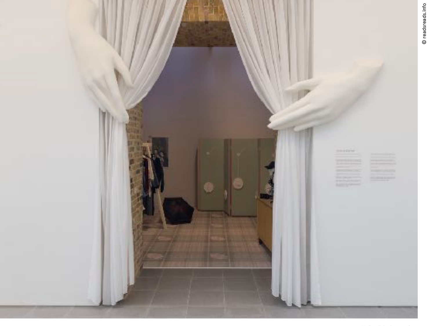
Atelier E.B, Passer-by Exhibition view, Serpentine Sackler Gallery, London (3 Oct 2018 to 6 Jan 2019)