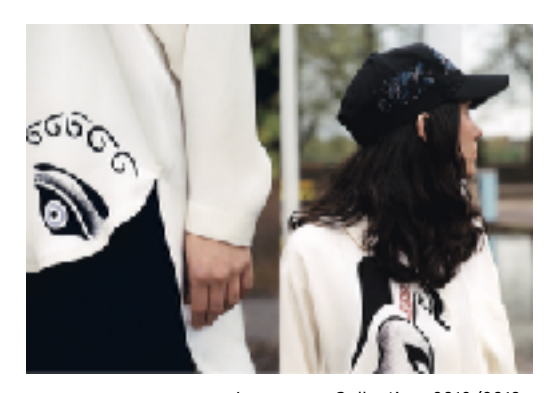
Jasperwear Collection, 2018/2019

Registration writing at <a href="mailto:cleosapp@ateliereb.com">cleosapp@ateliereb.com</a>