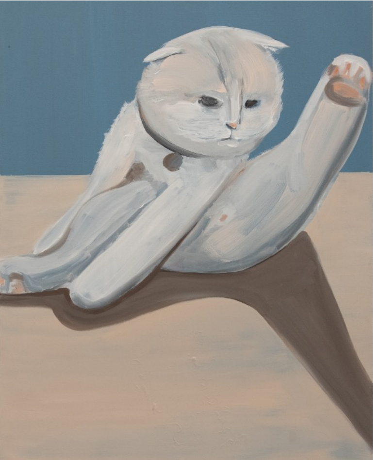
© Hesem Rahmanian, The Pets We Love , 2018 Courtesy of the artist and Gallery Isabelle van den Eynde