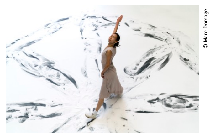
Anne Teresa de Keersmaeker, Violin Phase . Festival Echelle Humaine, édition 2018 with Festival d'Automne à Paris