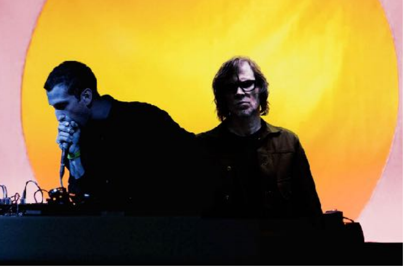
Not Waving & Dark Mark