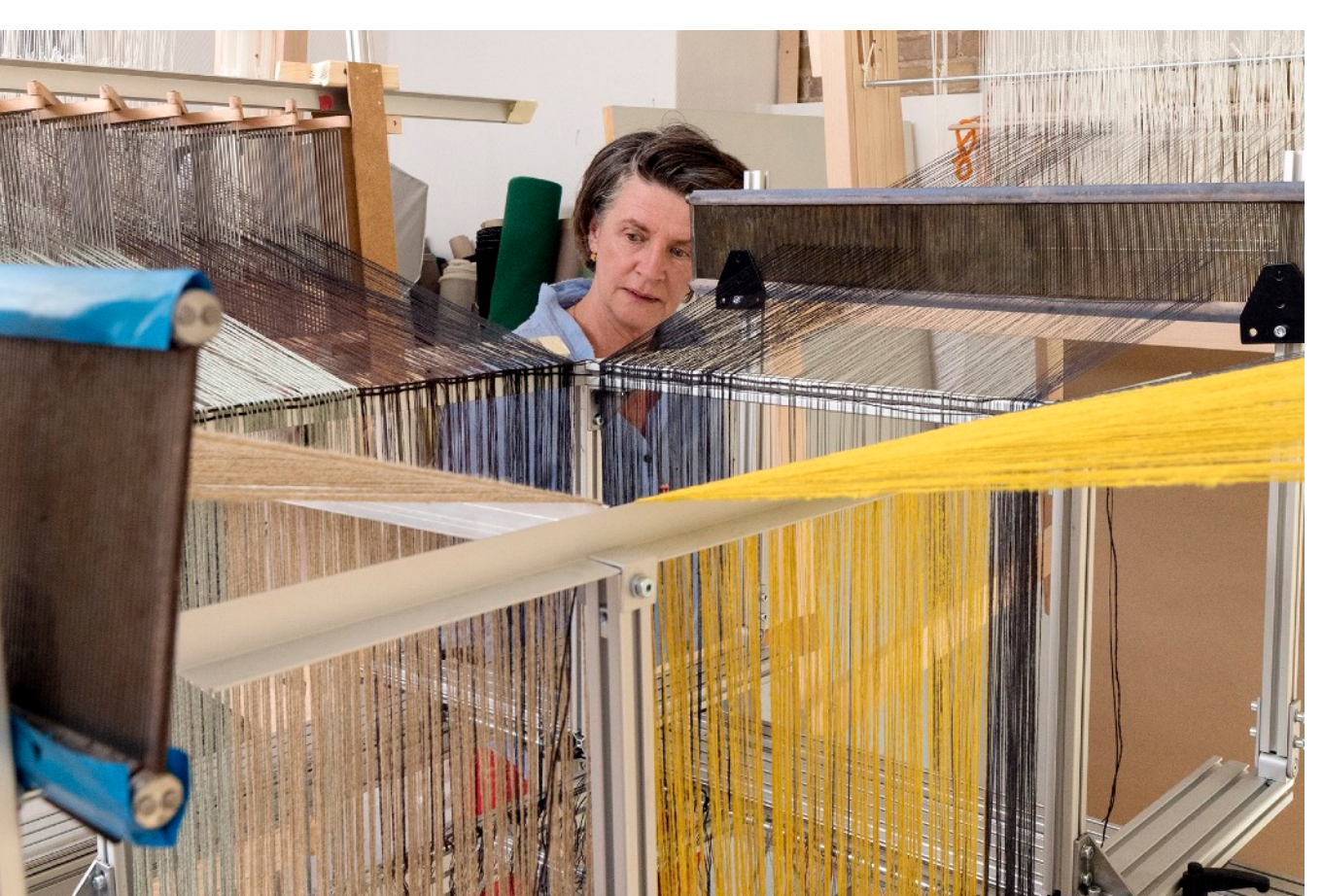
Research for the Seamless Loom