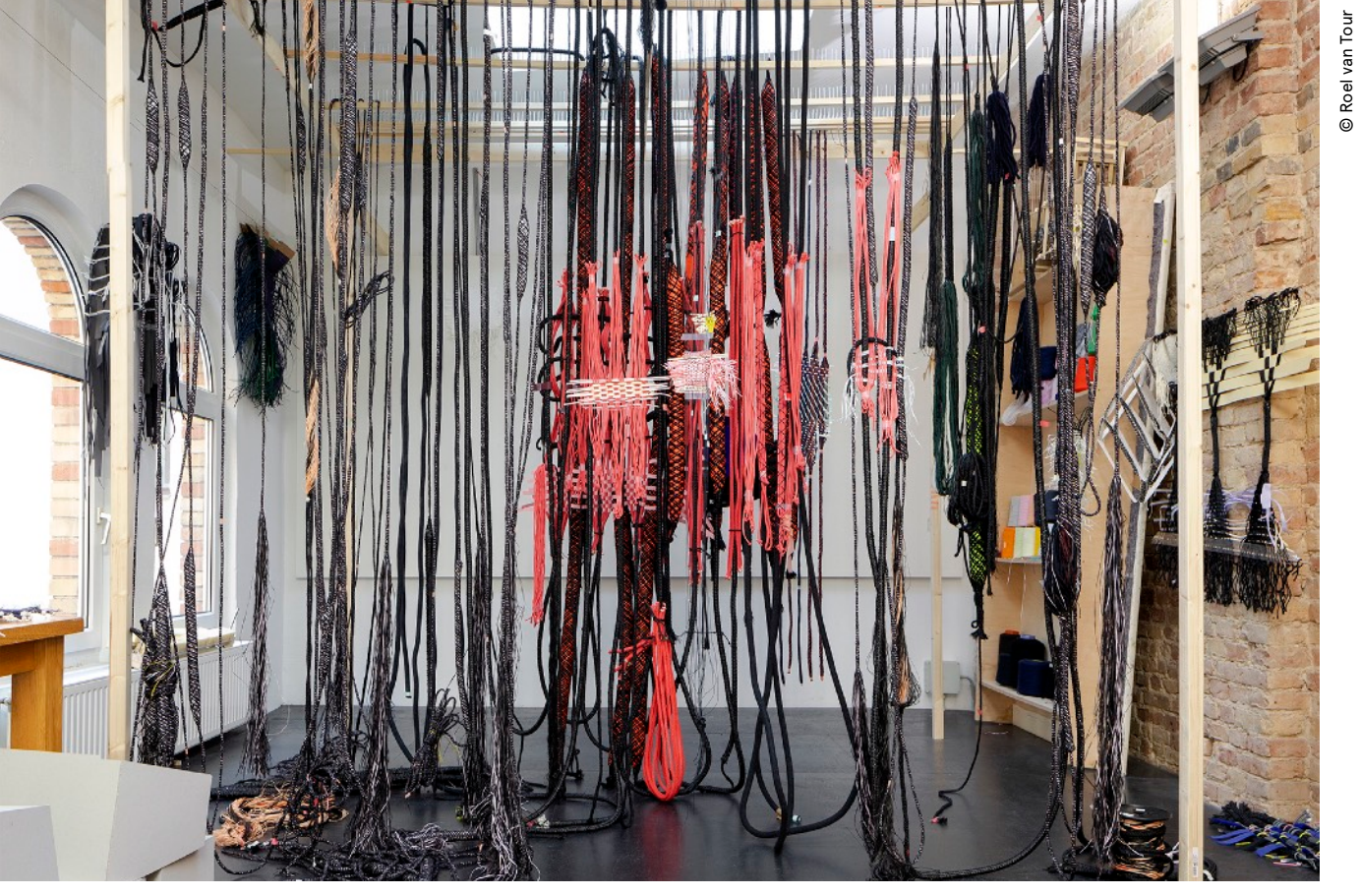
Research for the Space Loom