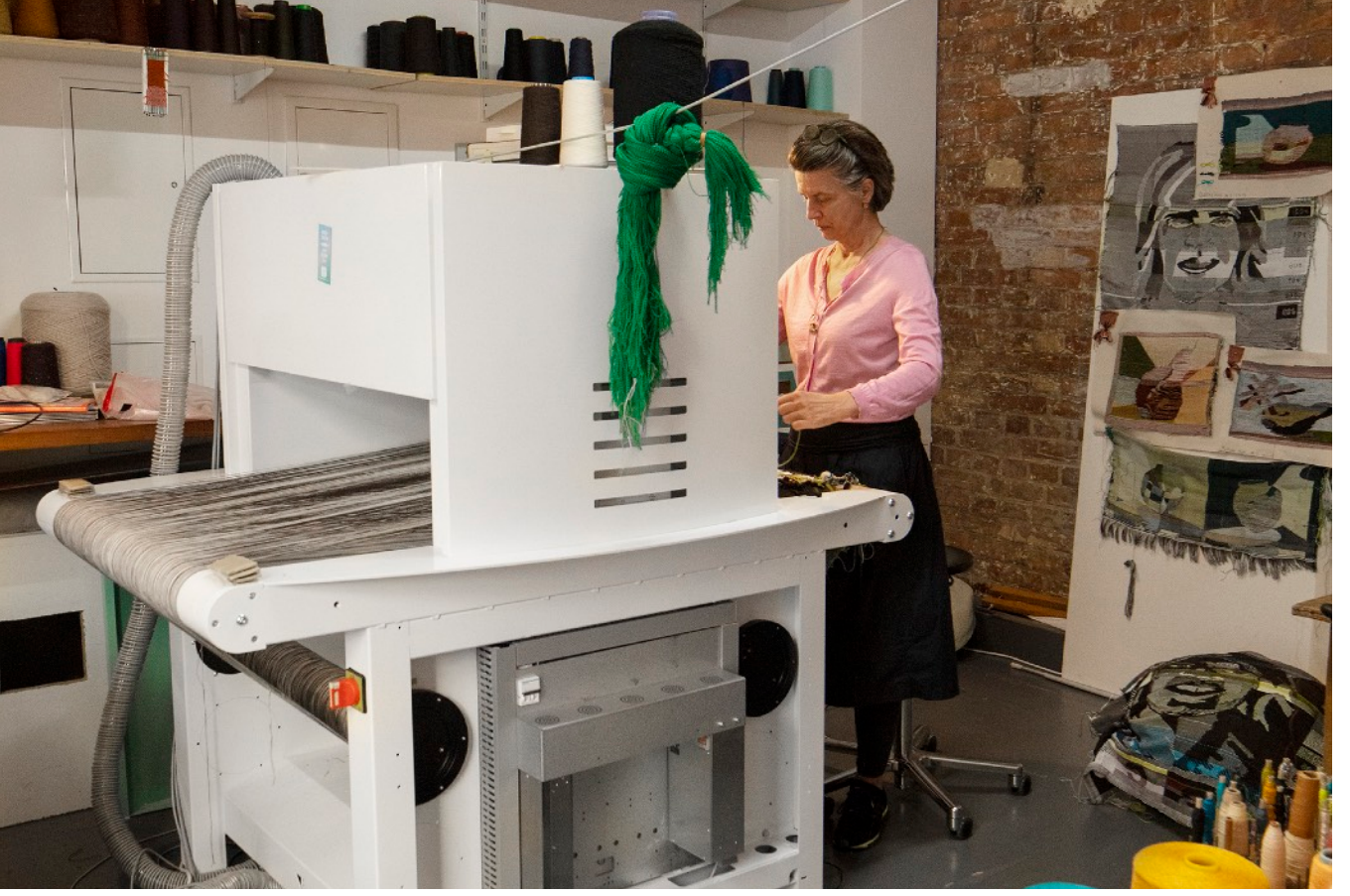
Research for the Digital Jacquard