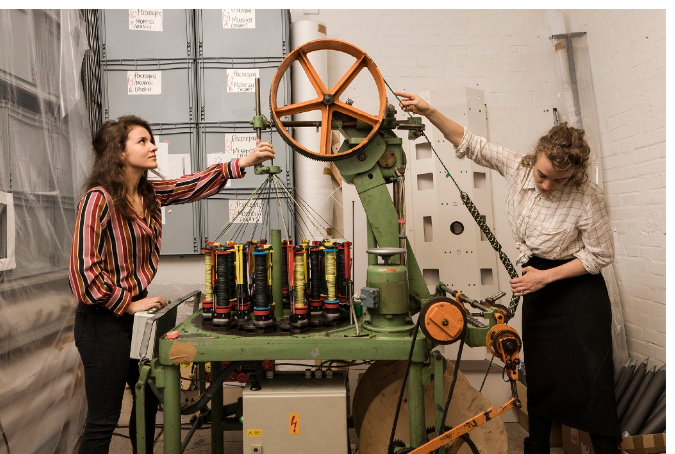
Research for the Space Loom