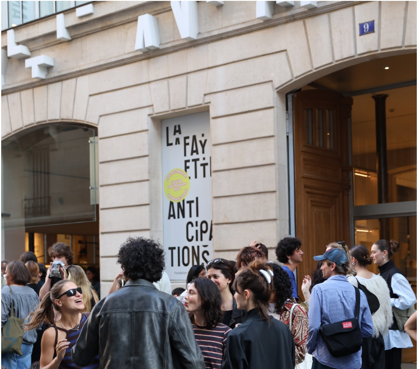
View of the 9 rue du Pilâtre, Lafayette Anticipations