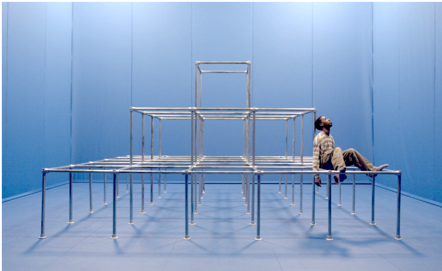
Research still, video work-in-progress (2025) © Steffani Jemison