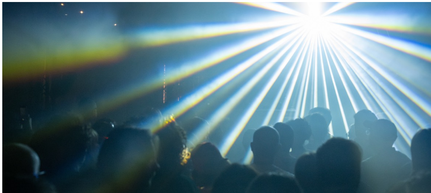
Closer Music, 2025