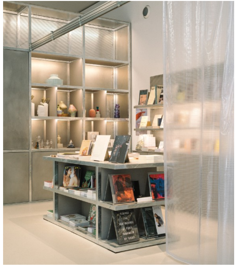
© Léna Domergue / Camille Lecomte, Lafayette Anticipations