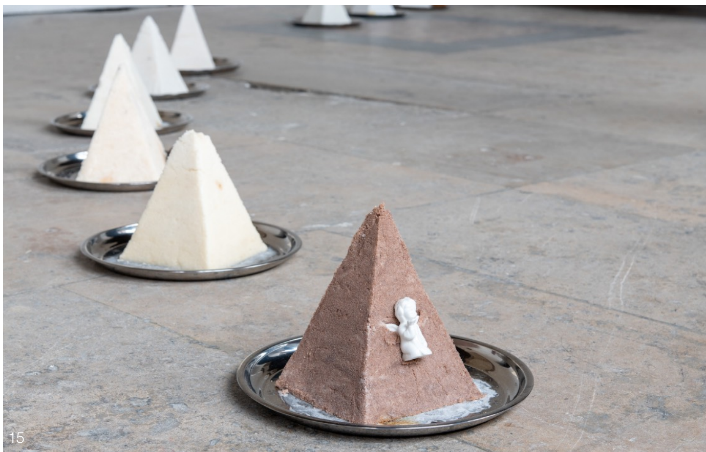
13, 14 & 15. Ladji Diaby, Untitled , 2025 © Ladji Diaby. Courtesy the Artist