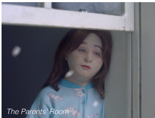
The Parents' Room