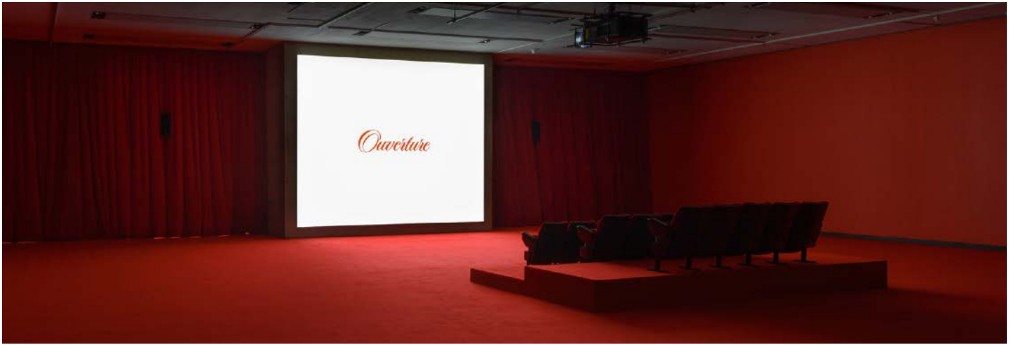
Installation view, La Gola , Kunsthalle Wien, Vienna.