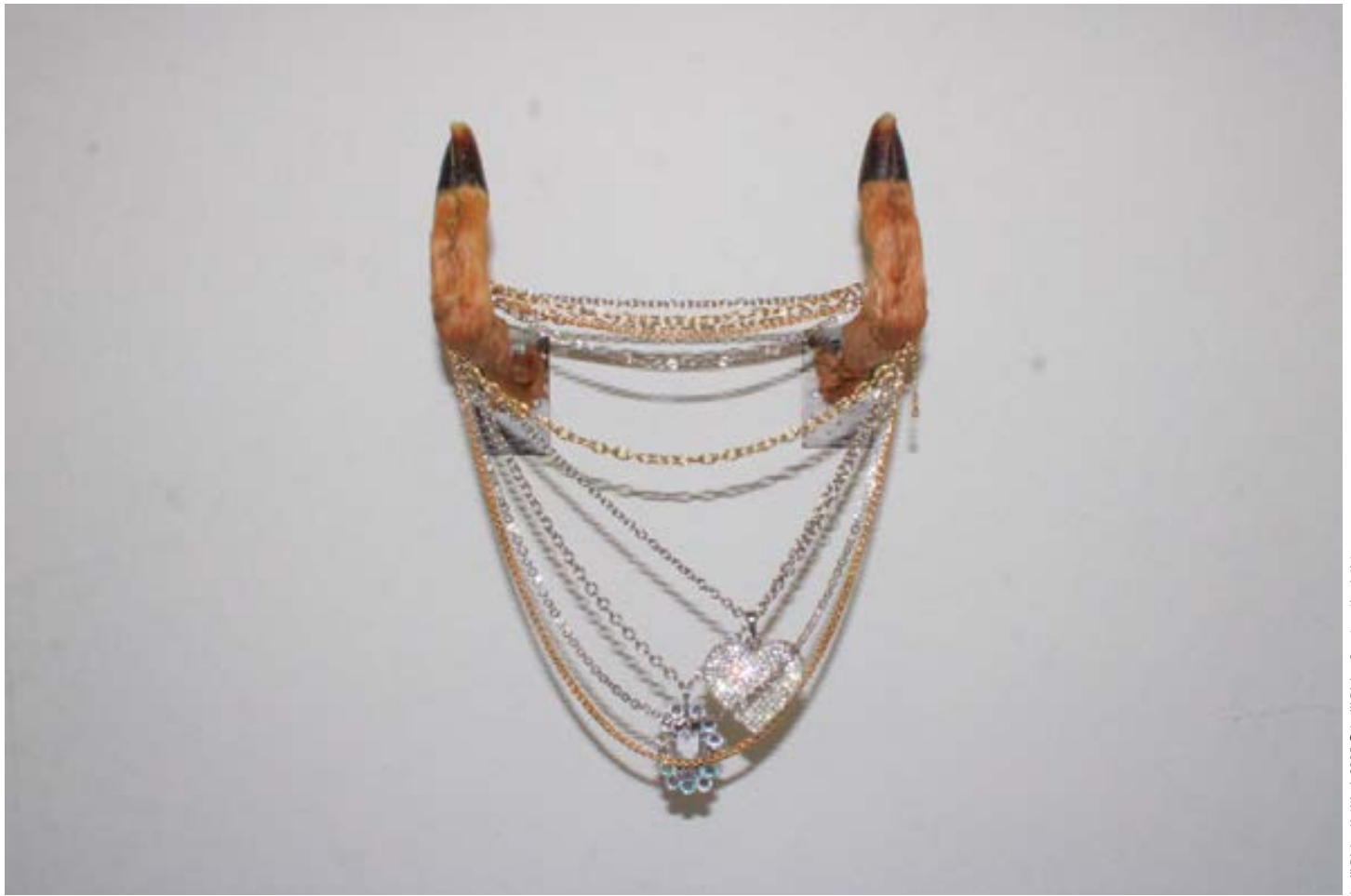
Ladji Diaby, Untitled , 2025 © Ladji Diaby, Courtesy the Artist