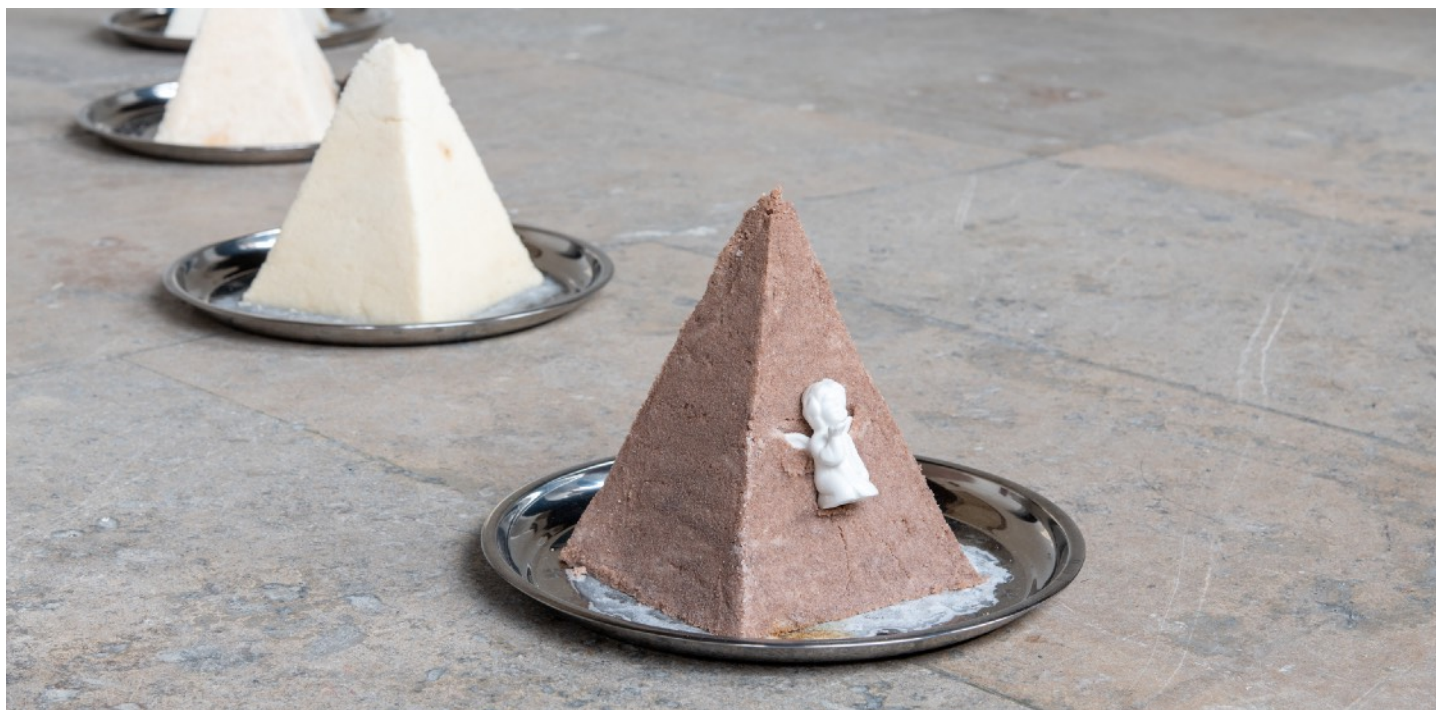
Ladji Diaby, Untitled , 2023 © Ladji Diaby, Courtesy the Artist